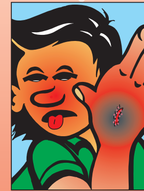
Child with serious skin infection