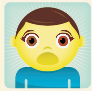
Child with minor cut, sore or other skin condition