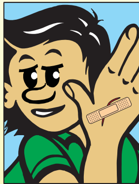
Child with minor cut, sore or other skin condition