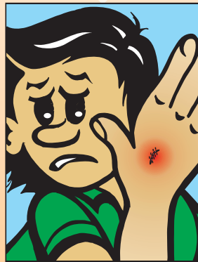
Child with minor skin infection