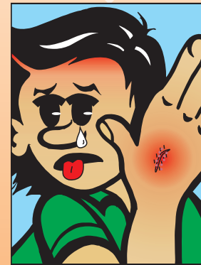
Child with skin infection that is getting worse